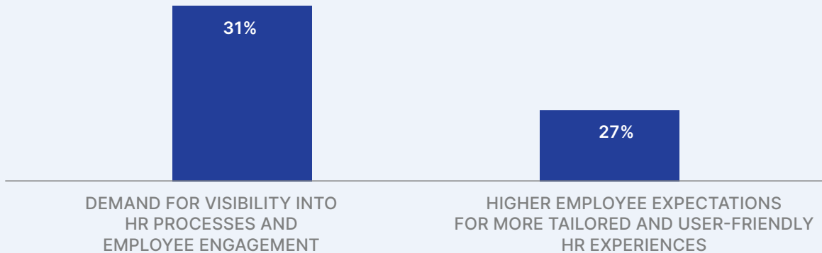
Figure 1: Key Drivers Shaping HCM and SAP S/4HANA Strategic Priorities in 2023

pate by moving to HXM systems — a better user experience for employees (63%) and increased employee satisfaction (45%). The transition to HXM allows organizations to reorient their HR strategies around enhancing the employee experience.